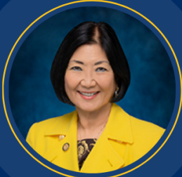
SENATOR SHARON Y. MORIWAKI